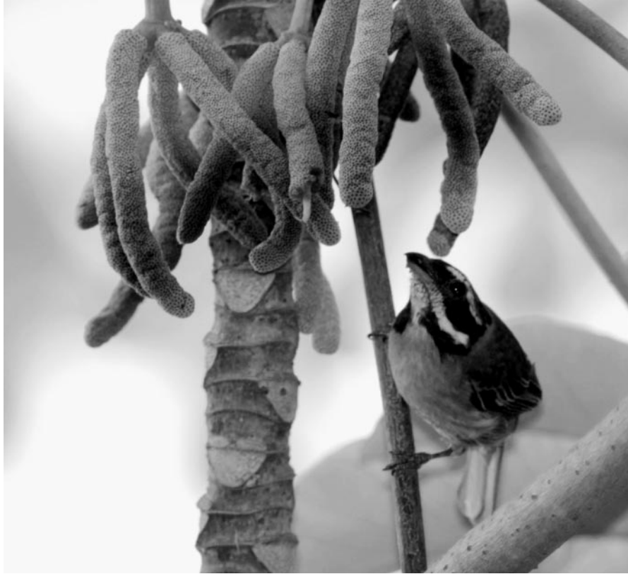
PLATE 1. Male Puerto Rican Spindalis ( Spindalis portoricensis ) feeding on the fruits of a female Cecropia schreberiana , a dioecious tree species. Spindalis visits female Cecropia trees more often than male trees to feed on fruit, but also feeds frequently on mistletoes that grow on Cecropia trees. Spindalis behavioral pattern matches the female-biased mistletoe infection pattern observed on Cecropia trees in Carite State Forest, Puerto Rico.

are important and abundant consumers of P. hexastichum fruits (Fig. 2) and predictable visitors to fruiting Cecropia females, but not to males (Fig. 2). It is noteworthy that we did not observe Euphonia musica visiting uninfected Cecropia trees. The absence of this species in our observations suggests that nonspecialized frugivores that use both Cecropia and P. hexastichum are responsible for the majority of first-time infections in noninfected Cecropia .