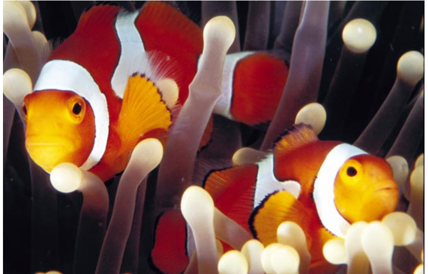
Figure 1 Clownfish modify their size, rather than their behaviour, to ensure harmony in social groups.

Subordinates benefit from settling in an anemone and queuing for breeding positions 7,8 , their chances of success being determined by their rank within the group 8,9 . Dominants, however, gain no benefits from subordinates, which are potential challengers for their position (P.B., unpublished results). This asymmetry generates evolutionary conflict over subordinate group membership, and dominants occasionally